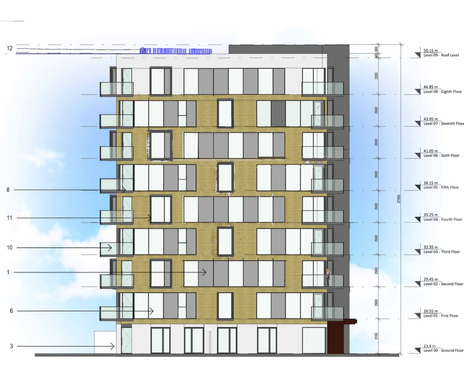
4 South 1:200