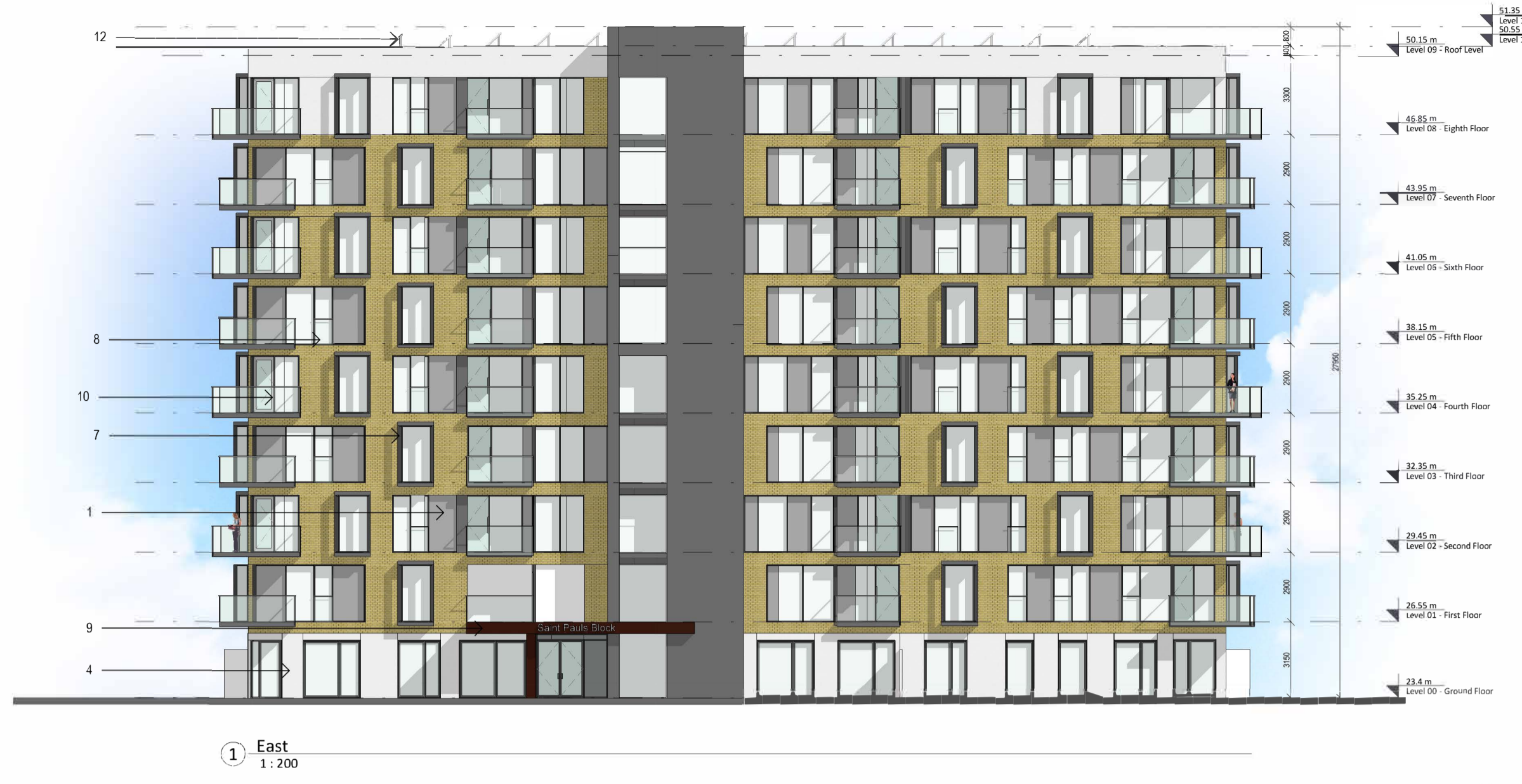
1 East 1:200