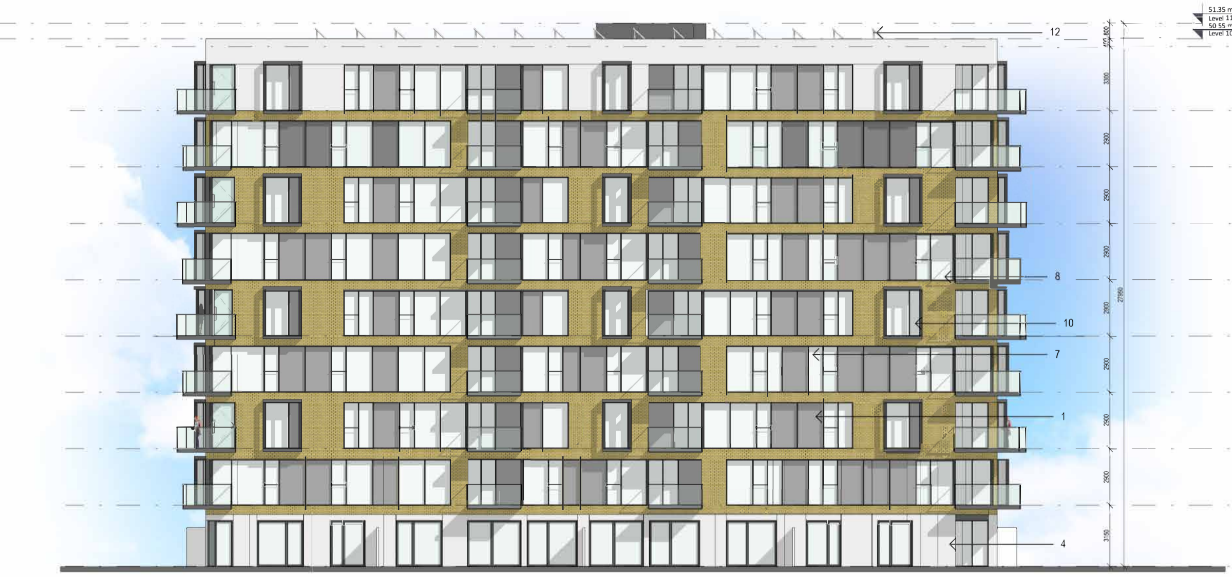
2 West 1:200