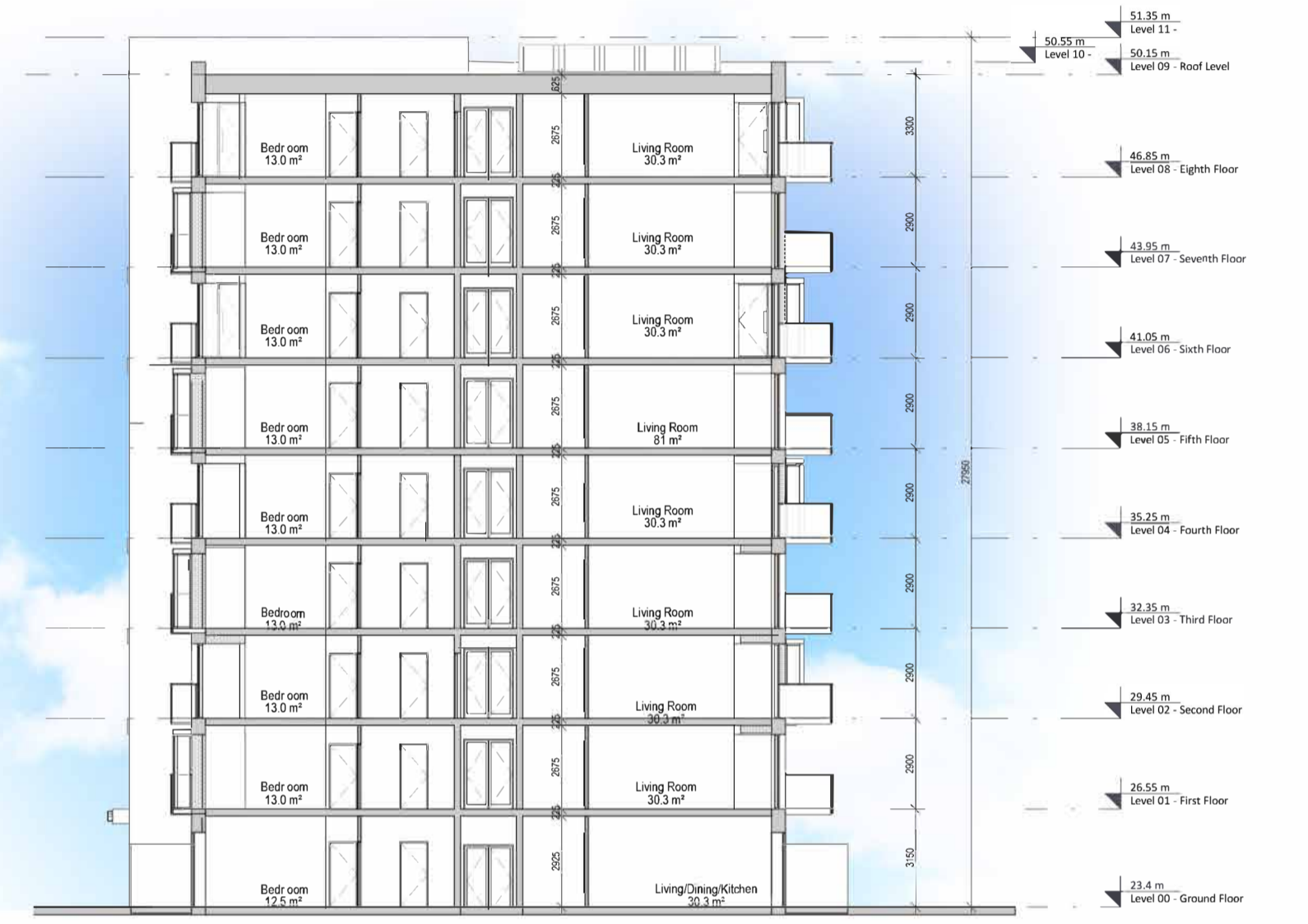
6 Section 2 1:200